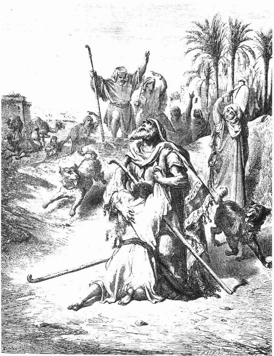
THE PRODIGAL SON IN THE ARMS OF HIS FATHER